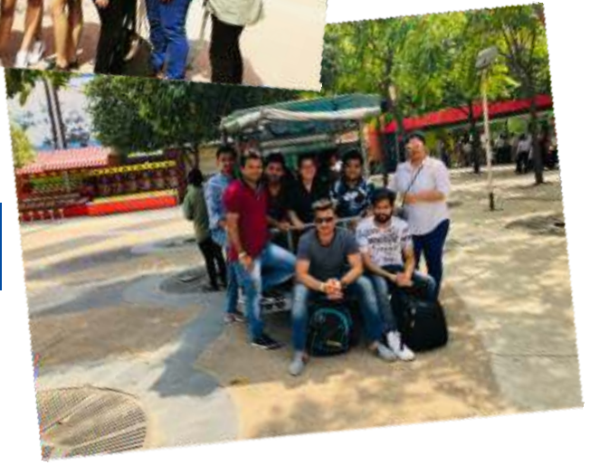
Trip to wow