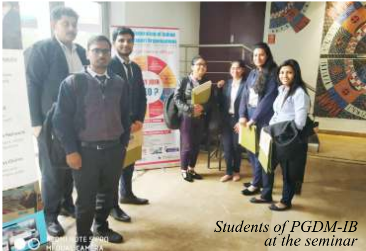
Students of PGDM-IB at the seminar

A seminar on 'Promoting Exports through Standards' organised by Federation of Indian Export Organization (FIEO) was held on 5th February 2019.