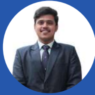
HARSHIT CONTENT CREATOR