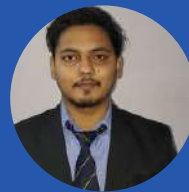
SURAJ CONTENT CREATOR

FEEDBACK AND SUGGESTIONS ARE WELCOMED. WRITE TO US AT PGDMOFFICE@JIMSINDIA.ORG