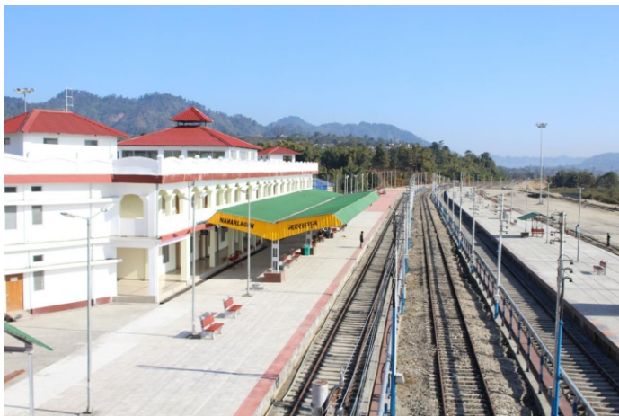
Naharlagun Railway Station

Arunachal Pradesh is a beautiful place with many tourist attractions. For instance, Ganga Lake, is a tourist spot in Itanagar while Boong Boong falls are near Itanagar. Ita Durga, an ancient fort is located in the city of Itanagar. This is also the reason for naming of Itanagar which got its name from from Ita Durga. Ganga Bazaar is a prominent place in