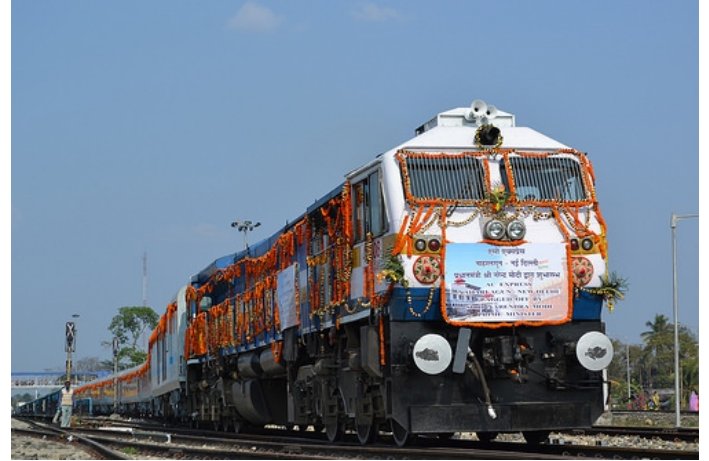
New Delhi-Naharlagun AC Superfast Express

A train which goes to Arunachal Pradesh is one such feather in the cap of achievements of Indian Railways. Arunachal Pradesh is one of the most north-eastern and remote areas that has a very challenging terrain. Indian Railways has made a significant stride to connect this state with its pan-India railway network. Our Hon'ble Prime Minister, Shri. Narendra Modi inaugurated the first train going to Arunachal Pradesh from Lucknow Charbagh Railway Station in the year 2015. The train is named New Delhi-Naharlagun AC Super-Fast Express. Naharlagun is the place situated near Itanagar City, a part of Itanagar District of Arunachal Pradesh. The train is fully air-conditioned with a pantry car and has three travel categories - First AC, AC Sleeper Two-Tier and AC Sleeper Three Tier.